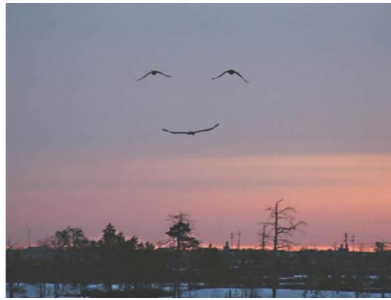
About time - a smile from Heaven.

“Freethinker” subscribers will be familiar with the “Jesus & Mo” cartoons that feature in most issues. I thought readers who do not get “The voice of atheism since 1881” might be interested in seeing one. You can see more by logging on to www.jesusandmo.net or taking out a special 6 month trial subscription to the NEW LOOK monthly magazine for just £5.00. Amazing value!! Just send a cheque to “G W Foote & Co” at Freethinker, PO Box234, Brighton BM1 4XD.